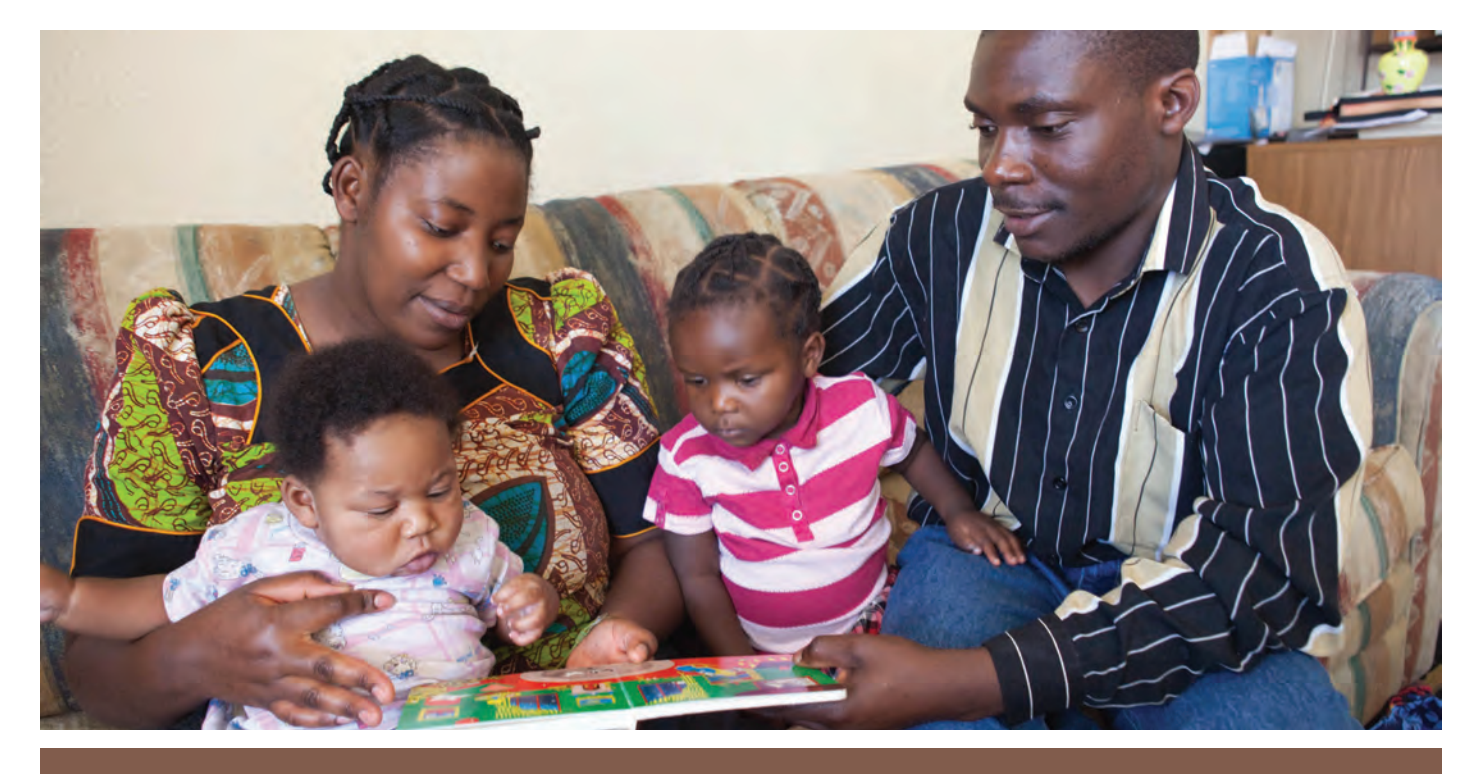
Programs can use the Framework in partnership with families to promote strong child outcomes.

Children are engaged and eager learners from birth. Effective early childhood programs build on children's readiness to learn by creating stimulating and safe environments and supporting positive adult-child relationships. Aligning teaching and program practices with the learning outcomes in the Framework will promote more effective educational experiences and stronger child outcomes. Thoughtfully-designed practices will motivate and excite children and foster their internal desire to learn. Implementing the Framework will assist programs in their efforts to ensure all children become successful learners in school.