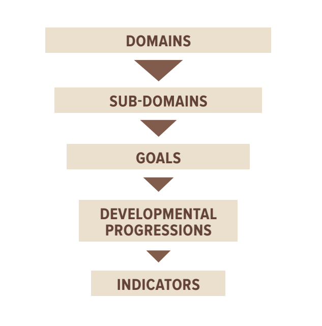
FIGURE 1: FRAMEWORK ORGANIZATION

Each domain is related to and influences the others. For example, as preschoolers' working memory develops (a component of Approaches to Learning), their ability to follow multiple-step instructions improves, and their ability to learn complex math concepts increases.